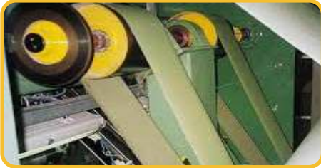
Nylon Transmission Belt as per IS 6538 (Nylon Leather/Rubber Nylon/Tangential, up to 7.5 mm Thick & 0.7 m W)