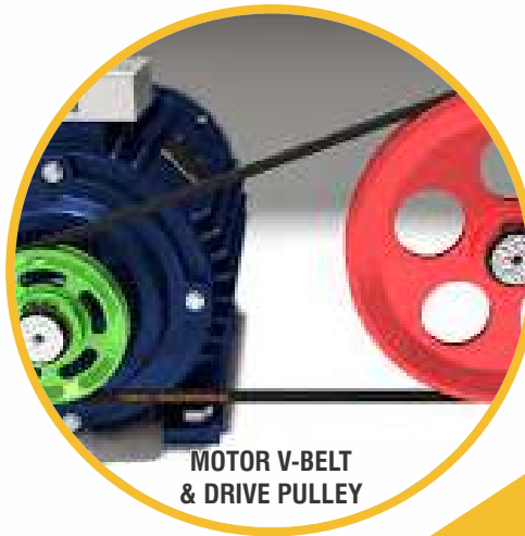
MOTOR V-BELT & DRIVE PULLEY