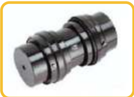
Flex RRL Spacer Coupling as per BS 3790 (Bore 95 mm Max, 2750~5000 Speed)