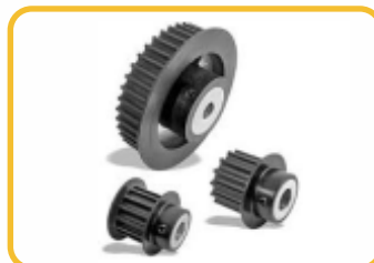
Timing Belt Pulley as per ISO 2768 (XXH/XH/H/L/XL, 10~50 Tooth, up to 50 inch W)