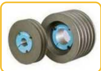
V Pulley with Taper Bush as per IS 3142 (C/SPC, B/SPB, A/SPA, E/D, 3V/5V, 2~12 Groove, up to 1250 mm PCD)