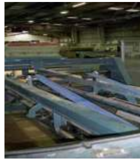
Flat Belting Curing Press