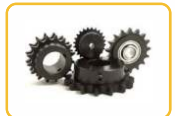
Roller Chain Sprockets as per ISO 1275 (Simplex/Duplex/Triplex-A/B/C/D type Hub, 9~140 Tooth, up to 60 inch Diam.)