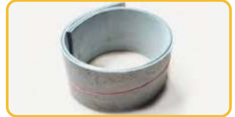
Leather Transmission Belting as per ISO 4184 (Leather Nylon core, up to 8 mm Thick & 300 mm W)