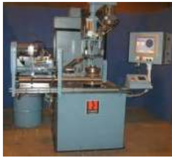
Dynamic Balancing Machine