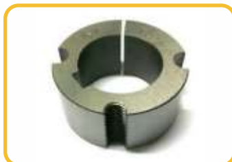
Taper Bush as per DIN 6885 (WH1008~WH5050, 1 25 mm Bore max)