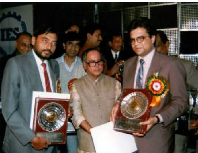
Export Award Honoured in Feb 1997

belts@universaldelhi.org ; universal@hic-india.com ; export@hicrubber.com