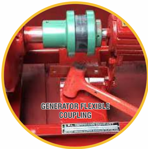
GENERATOR FLEXIBLE COUPLING