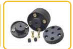
Flexible Pin Bush Coupling as per IS 2693 (Bore 190 mm Max, up to 530 mm OD)