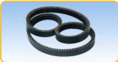
Wedge V Belt Cogged FRAS as per IS 2494 (SPC/SPB/XPA/SPZ, E/D/C/Bx/AFHP, 3V/5V, BB/CC, up to 675 inch L)