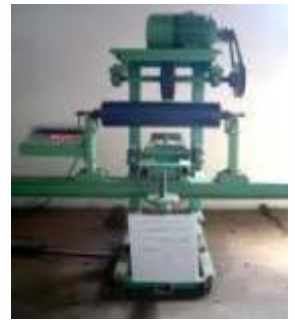
Friction Test Apparatus