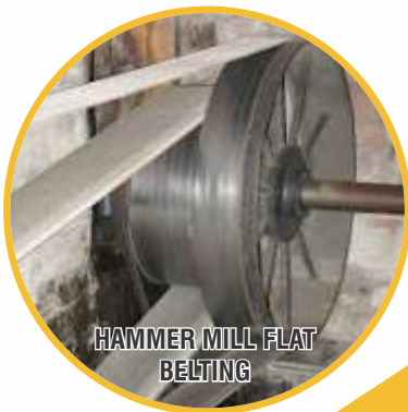
HAMMER MILL FLAT BELTING