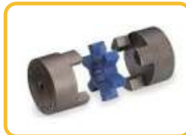
Flex Snap Wrap Coupling as per BS 3790 (Bore 75 mm Max, up to 192 mm OD)