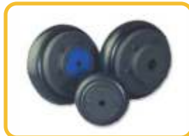
Flex Rubber Tyre Coupling as per BS 4235 (Bore 220 mm Max, up to 550 mm OD)