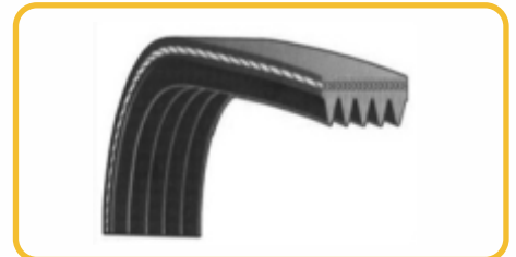
Poly V Belt as per DIN 7753 (3PK/4PK/5PK/6PK/8PK, up to 2500 mm L)