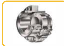
Flexible Gear Type Coupling as per IS 12405 (Bore 240 mm Max, up to 570 mm OD)